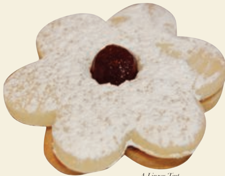
A Linzer Tart