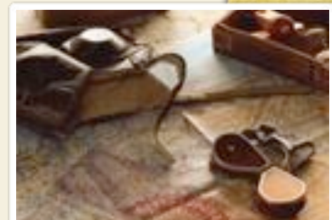
DISCOVER HISTORIC TYRRELL COUNTY

grills. FYI: our charming Victorian town of Columbia, NC is part of the Inner Banks (IBX®) and located about a good half hour drive from the Outer Banks (OBX). Other attractions include the Palmetto Pear Tree reserve, deep-water anchorages at the town docks and a boardwalk for walking along the water's edge and maybe enjoying an ice-cream cone. This web site gives a pretty good impression of the town: www.Columbia.NC.com