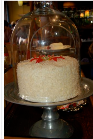
WHERE LIFE IS STILL WORTH LIVING 365 WONDERFUL EASY GOING DAYS OF THE YEAR!

When I was a teenager, not a day went by that I didn't think about my weight. As luck would have it, after the summer was over, I was thrilled with how I looked, having returned to school several pounds lighter than I left. After all everyone wanted to be a model and I had the face they said, but with my height 5 foods 5 - I was supposedly not tall enough ( Every day we all stopped at our favorite bakery and got the largest brownie left in the display. My intentions were always to start on a restrictive diet program as soon as I was full.